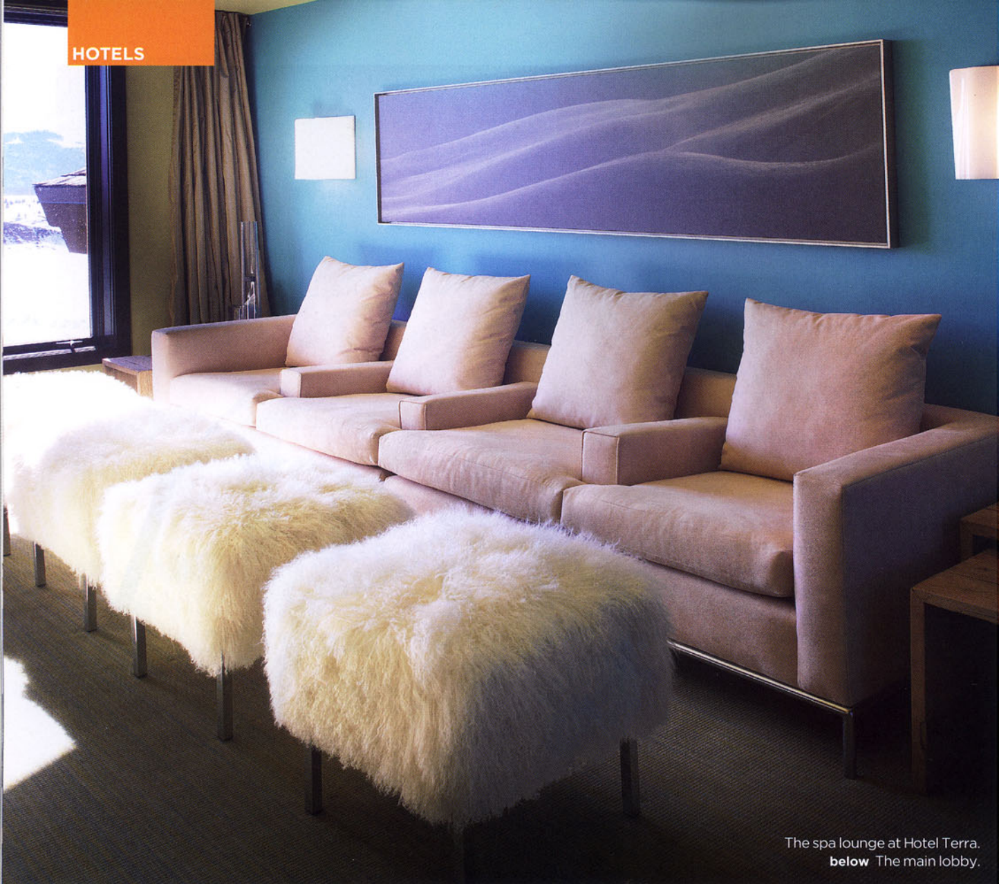
The spa lounge at Hotel Terra. below The main lobby.