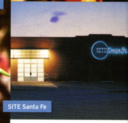
SITE Santa Fe