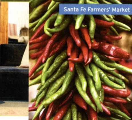
Santa Fe Farmers' Market