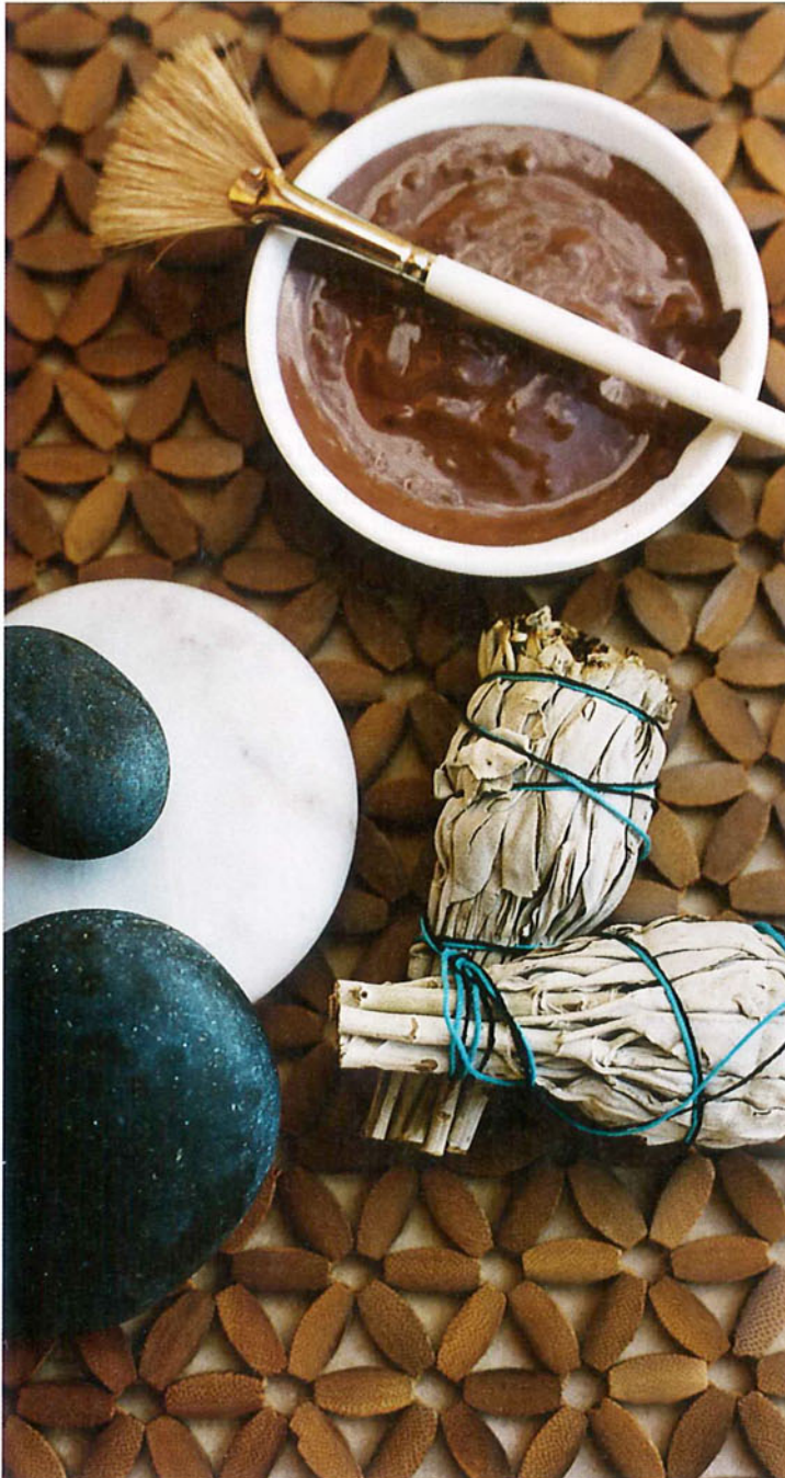
SPA AT ENCANTADO

able, like natural hot springs and local herbs. In searching for massages, wraps, masks, and scrubs inspired by regional Native practices, we looked beyond clever marketing to find local spas that offer treatments truly based in indigenous wisdom. These four options are among the most legit (and luxurious) around.