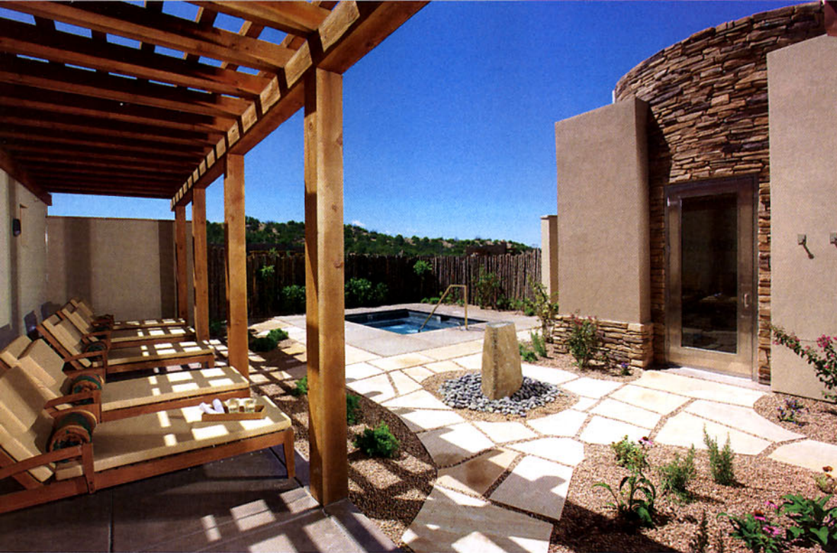
SEPARATE SPA AREAS (above) allow for private indulgence for both men and women.