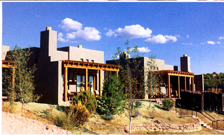
CASITAS (left) are perched on slight inclines to give optimal views of the New Mexico sunsets.

ceremony followed by an adobe clay body mask. After a restful wrap with a scalp and foot massage, the lucky guest is awakened to enjoy a rain shower rinse, ending with a juniper-sage massage. Note: Susan O'Bryen (sobryen@encantadoresort.com; 505-988-9955), director of spa services, encourages clients to book spa treatments at least two weeks out.